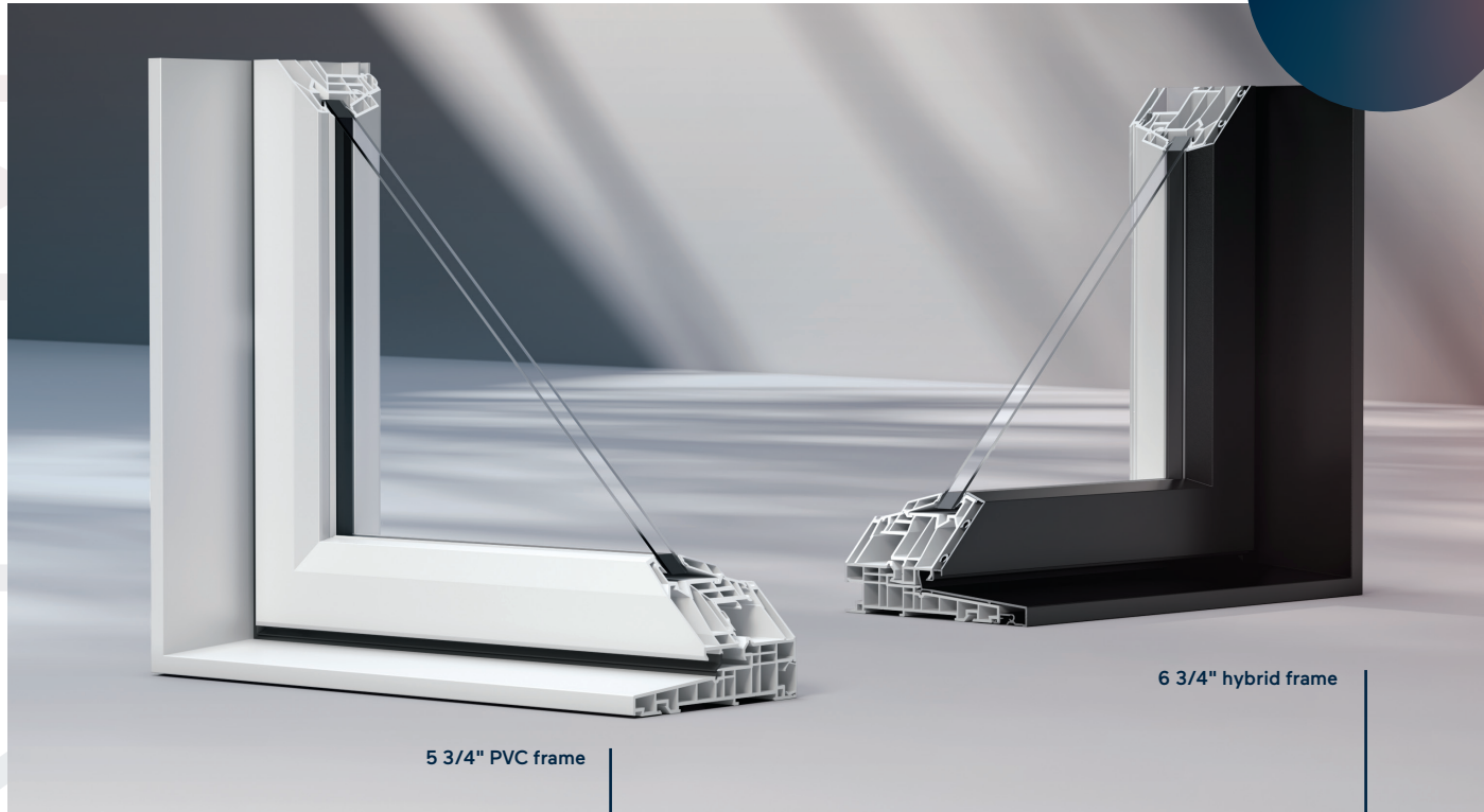
5 3/4" PVC frame